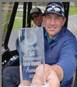
Cov'Aide 54 Golf Invitational Champions